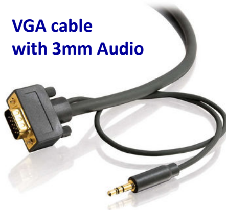
VGA cable with 3mm Audio

NOTE: ALL AUDIO GOES THROUGH THE LCD PROJECTOR. YOU WILL NOT HEAR AUDIO UNLESS THE LCD PROJECTOR IS TRUNED ON!